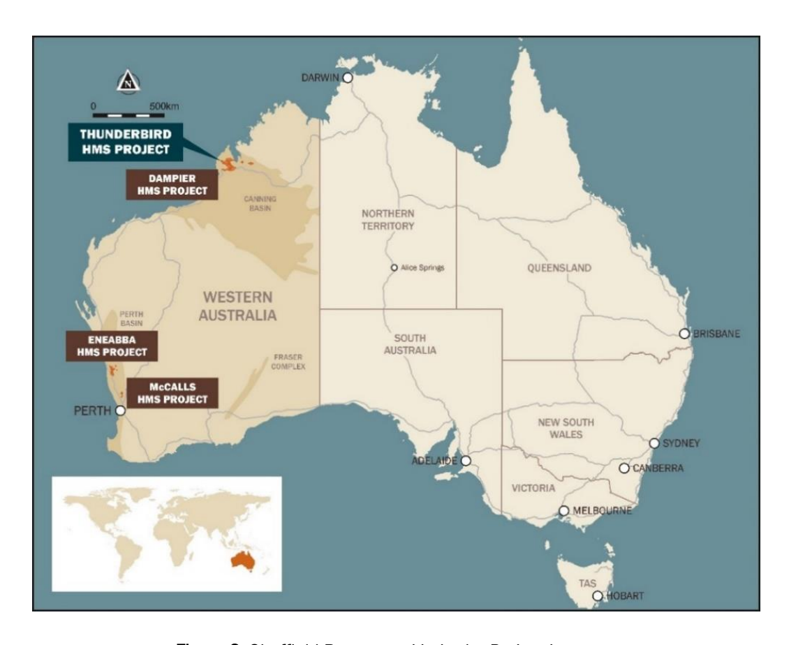
Figure 2: Sheffield Resources Limited - Project Interests

Activities focussed on an updated scoping study which commenced during the quarter. TZMI have been engaged to complete the study which covers the Company's tenement package at Eneabba, with results expected during the next quarter.