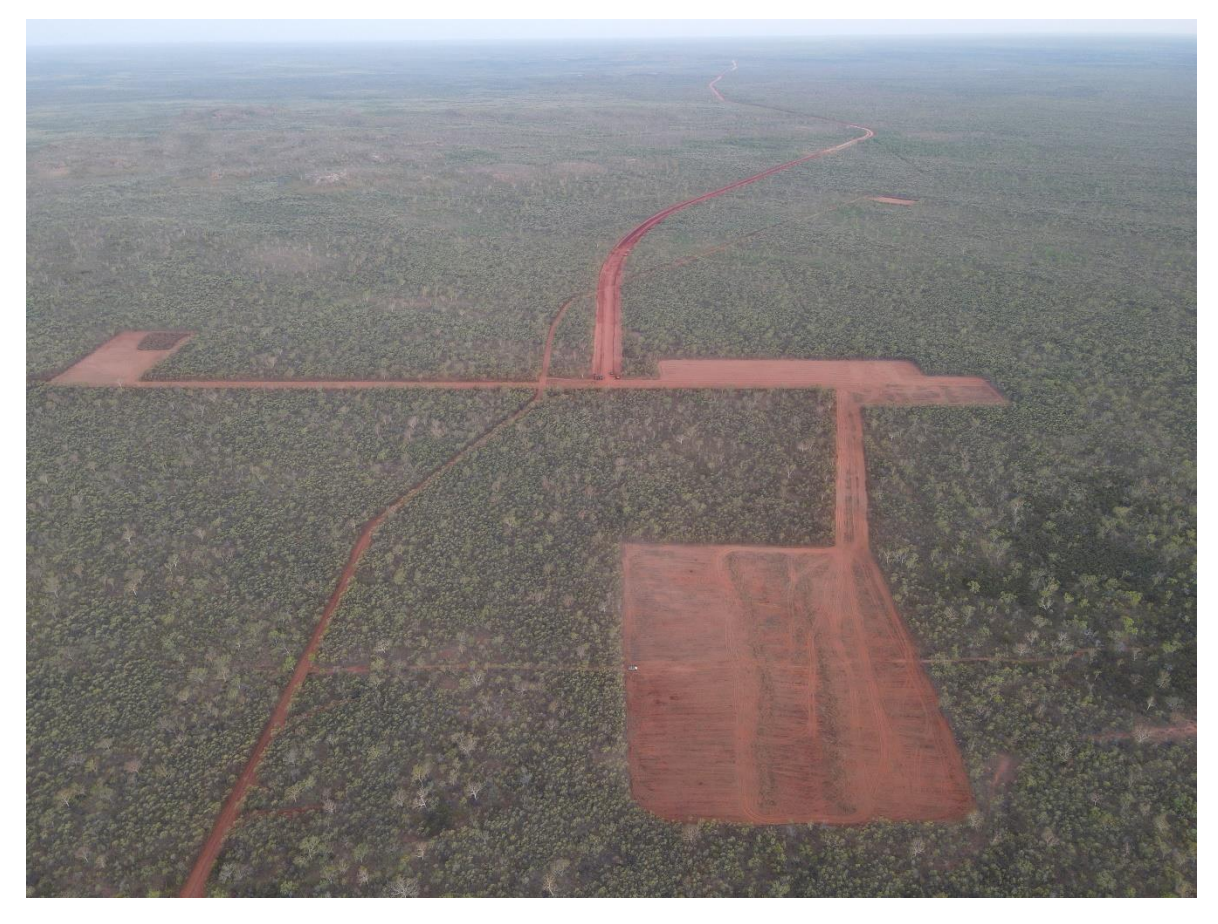
Figure 4: Thunderbird plant site clearance activities