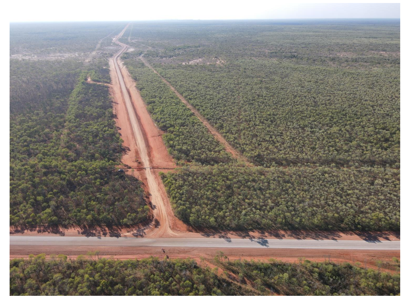
Figure 2: Thunderbird mine access road - under construction

An early works program including mine access road construction, process site clearance and other non-process infrastructure commenced during the quarter. The purpose of the early works program is to utilise the 2021 dry season to complete sufficient work to enable commencement of process plant construction at the beginning of the 2022 dry season.