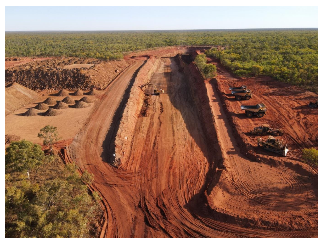
Figure 3: Mine trial pits 1 & 2 and ore and waste stockpiles