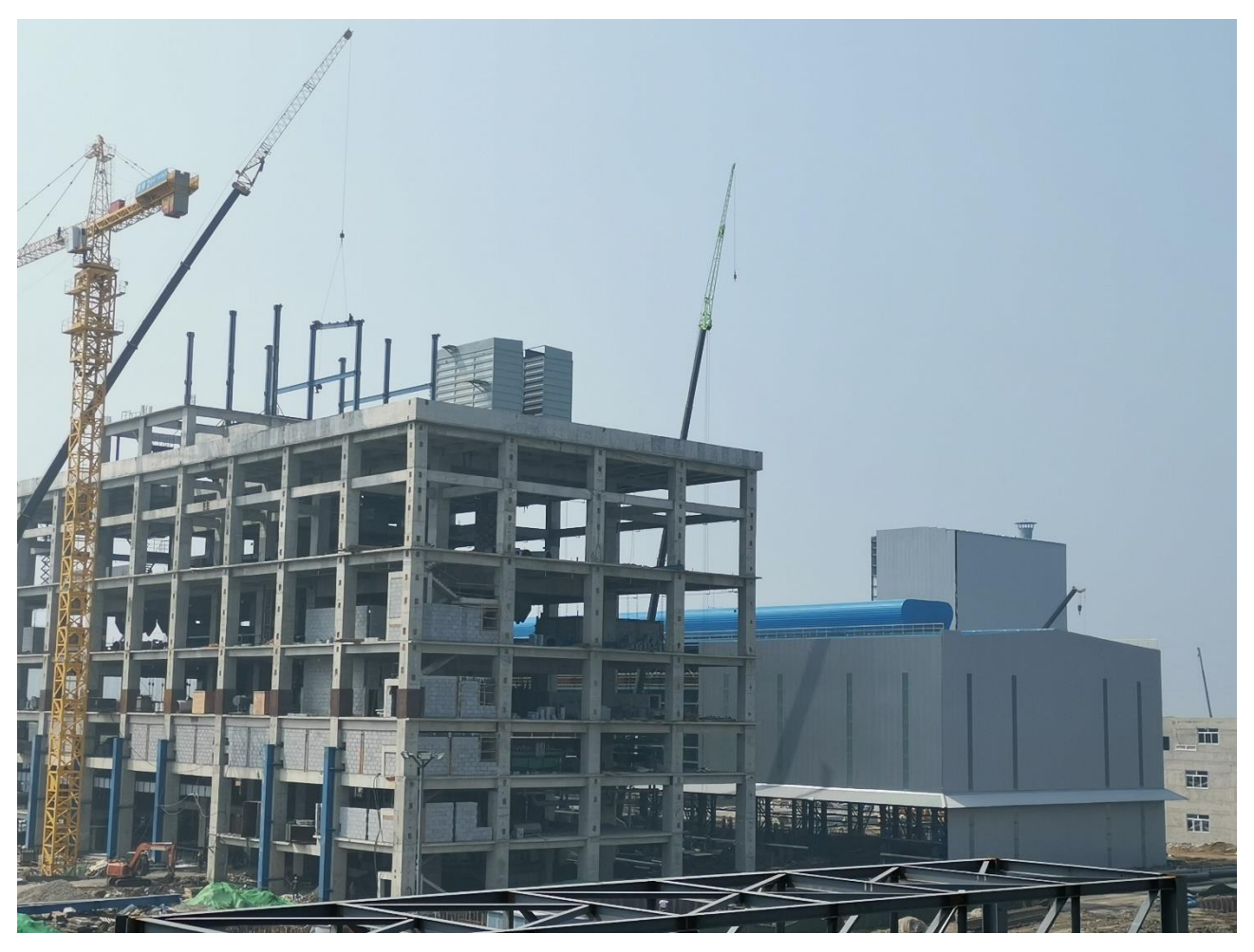
Figure 6: Yansteel smelter equipment installation