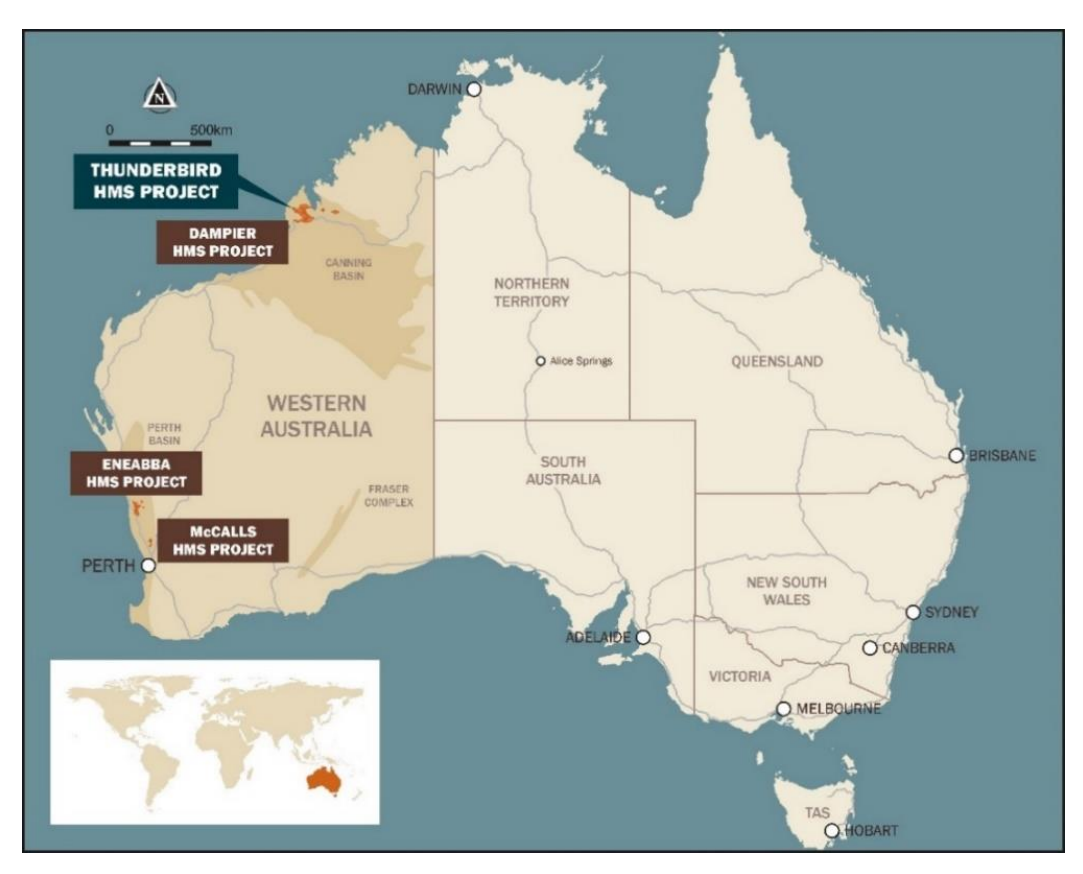
Figure 7: Sheffield Resources Limited - Project Interests