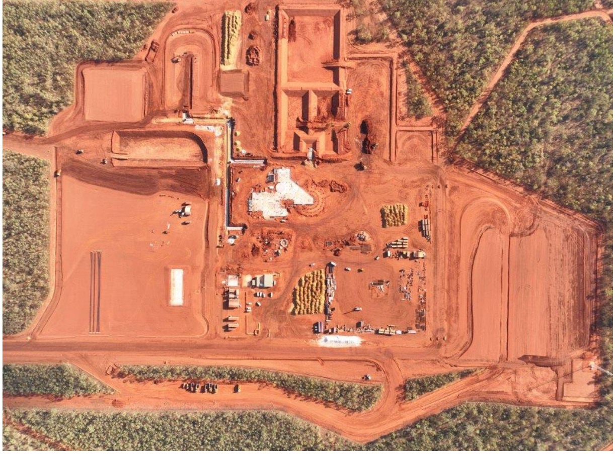
Image 5 & 6: Process Plant area (above) and Process Plant area concrete installation (below)