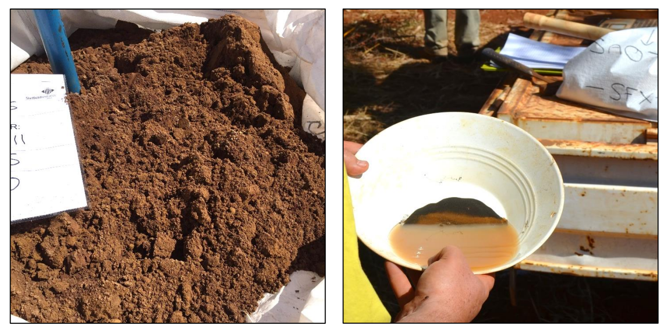
Figure 3: Raw (left) and panned (right) sample – THBA005

Samples from each hole were collected at ~1m intervals from surface to the base of mineralisation as determined from pit optimisation studies as part of the May 2015 Pre-Feasibility Study ("PFS") (see "Mining Inventory" in ASX announcement of 14 May, 2015). Geological and physical properties were recorded and sub-samples collected for heavy mineral assay and moisture analysis.