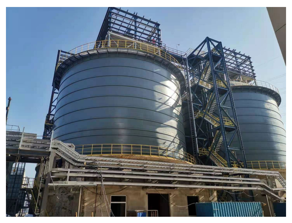
Figures 7 & 8: Yansteel Plant: Feed Storage Silos (above) and Processing Plant (below)