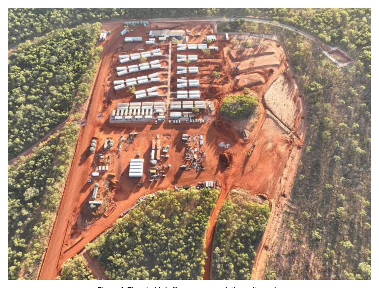
Figure 4: Thunderbird village accommodation - site works