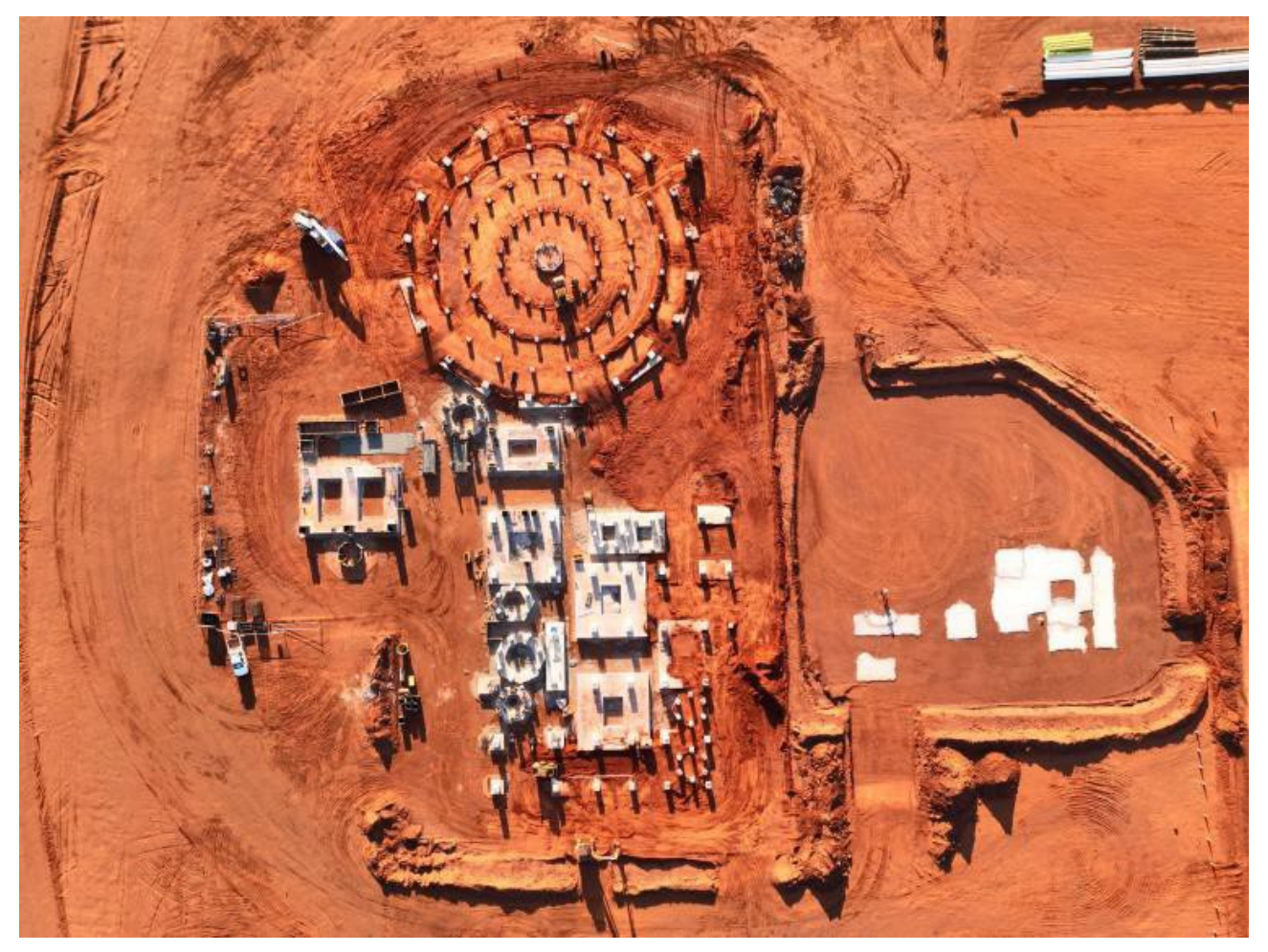
Figure 3: Thunderbird Project - Wet Concentrator Plant site concrete installation & civil earthworks

Following completion and award of the EPC contract with GRES earlier in the year (refer ASX announcement dated 24 March 2022) other major construction and supply contracts to support project development are nearing completion, inclusive of energy supply, power generation and mining services agreements. Due diligence and review of major contracts is now substantively complete by KMS financiers. Sheffield will inform the market of material developments in relation to each of the major construction and supply contracts upon their completion.