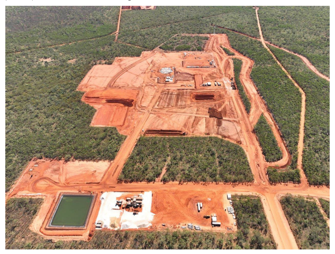
Figure 2: Thunderbird site layout showing Process Plant location (background) and concrete works batching plant (foreground)

Activities for the quarter at the Thunderbird Mineral Sands Project (Thunderbird) have seen significant progress in civil works, with progressive installation and occupation of site village accommodation, commissioning of the concrete batching and gravel screen plants and initial concrete pours at both the process plant and accommodation village areas.