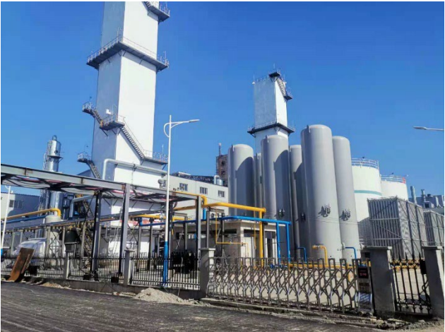
Figures 5 & 6: Yansteel Plant: 220KV Transformer (left) and Air Distribution plant (right)