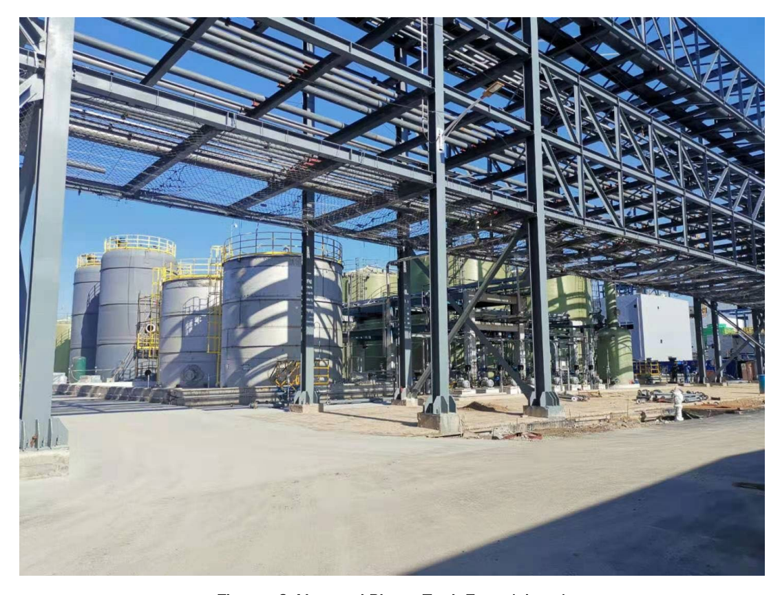
Figures 9: Yansteel Plant: Tank Farm (above)