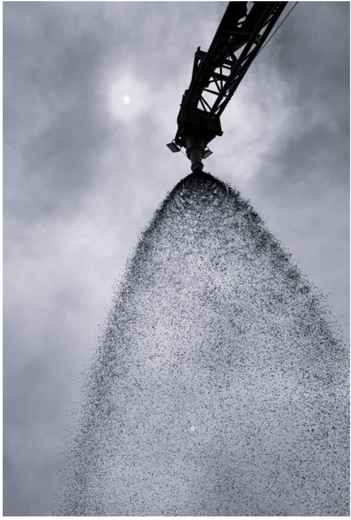
Image 6: Concentrate production at Thunderbird – cyclone discharge to stockpile