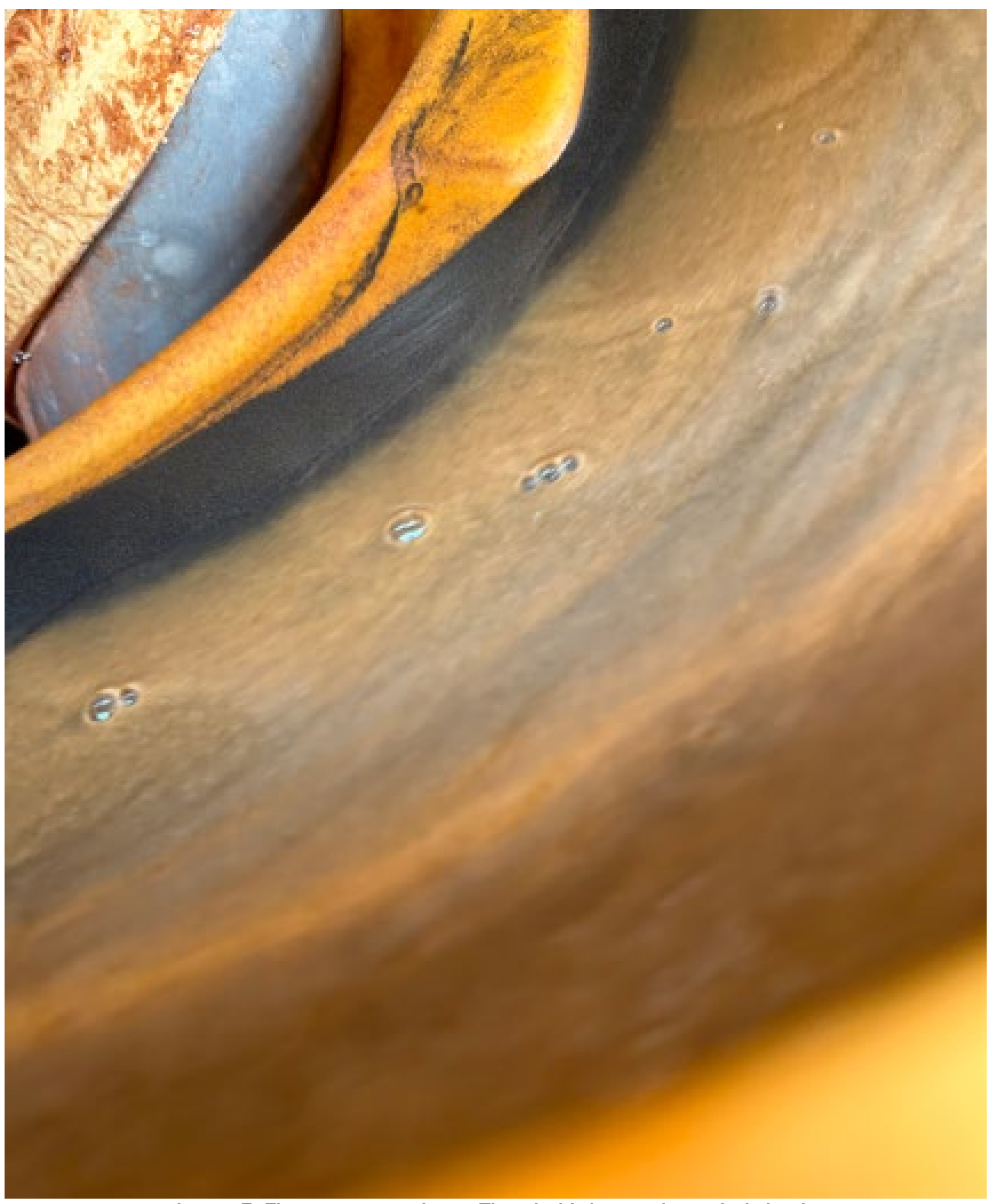
Image 5: First ore processing at Thunderbird – rougher spiral circuit