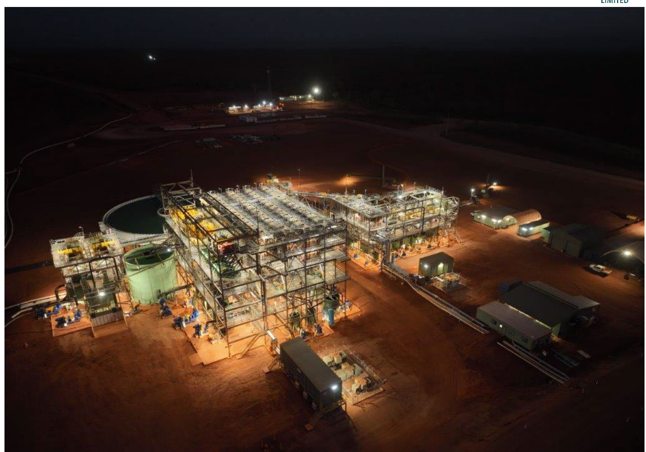
Image 1 & 2: Thunderbird Wet Concentrate Plant & Concentrate Upgrade Plant overview