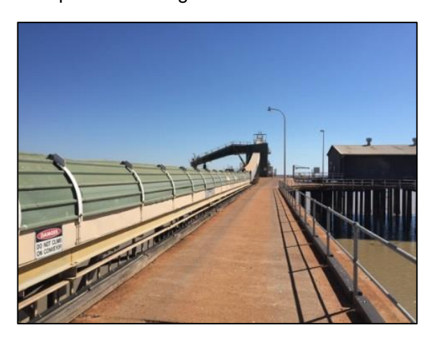
Figure 3: Conveyor and Ship Loader at the Derby Wharf