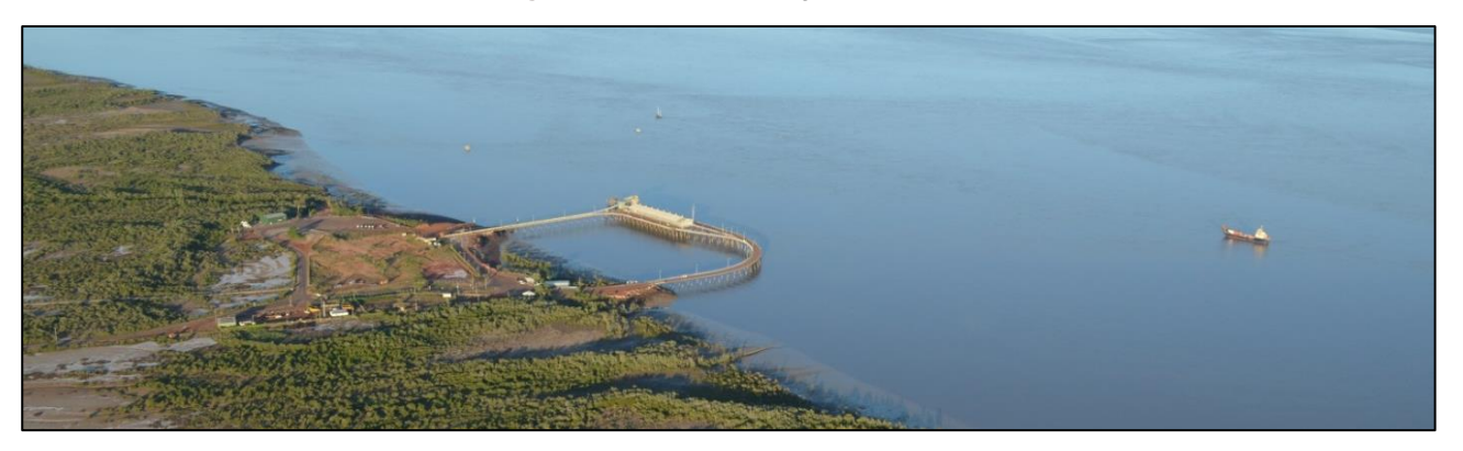
Figure 2: Derby Wharf