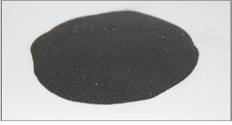
Figure 3: LTR ilmenite product