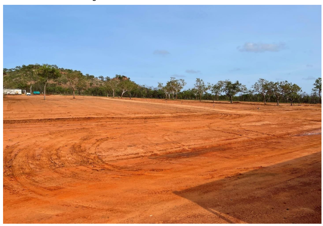
Figure 3: Thunderbird village accommodation site clearance activities