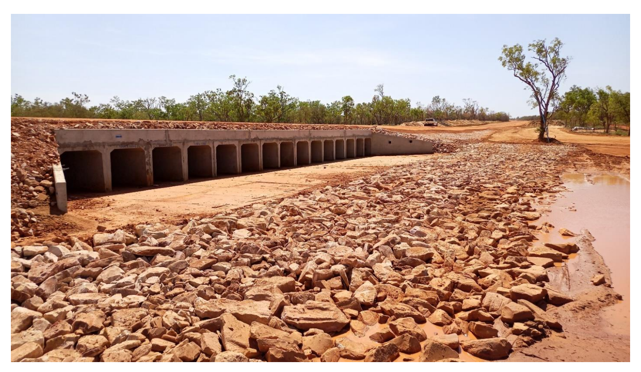
Figure 2: Thunderbird mine access road – culvert installation