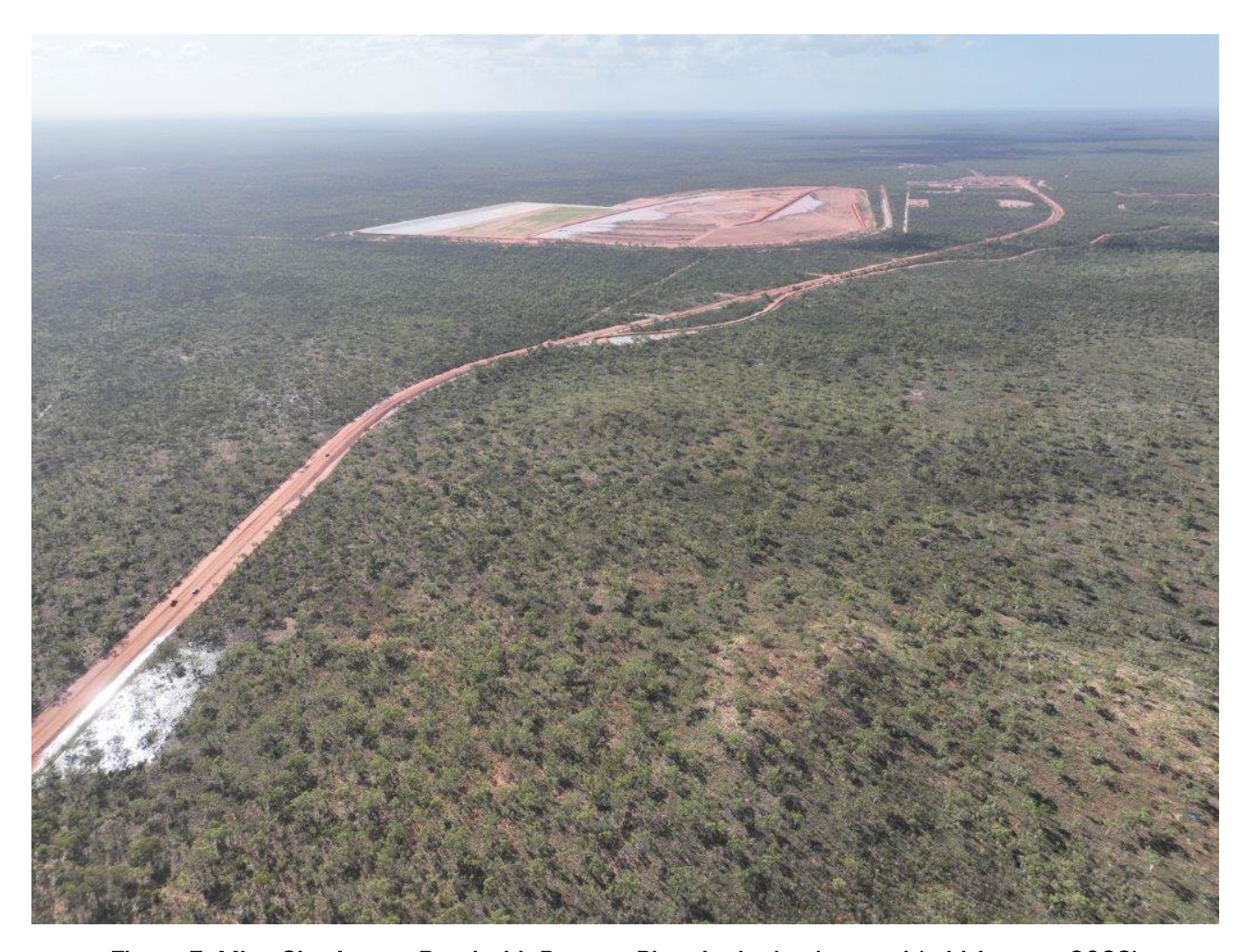
Figure 5: Mine Site Access Road with Process Plant in the background (mid-January 2023)

The December quarter resulted in significant progress toward completion of civil works, and plant infrastructure construction. Led by EPC contractor GRES, construction activities are progressing in line with planned schedules.