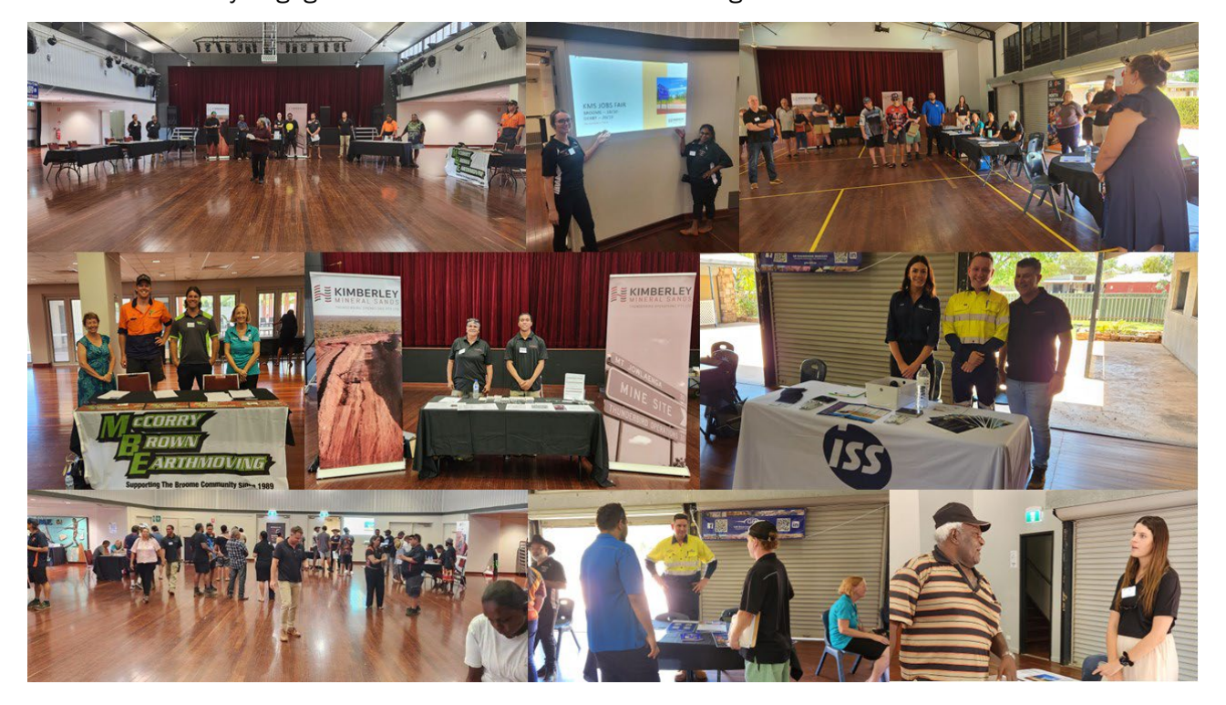
Figure 9: Kimberley Mineral Sands regional Jobs Fair

Further community engagement activities are scheduled throughout 2023.