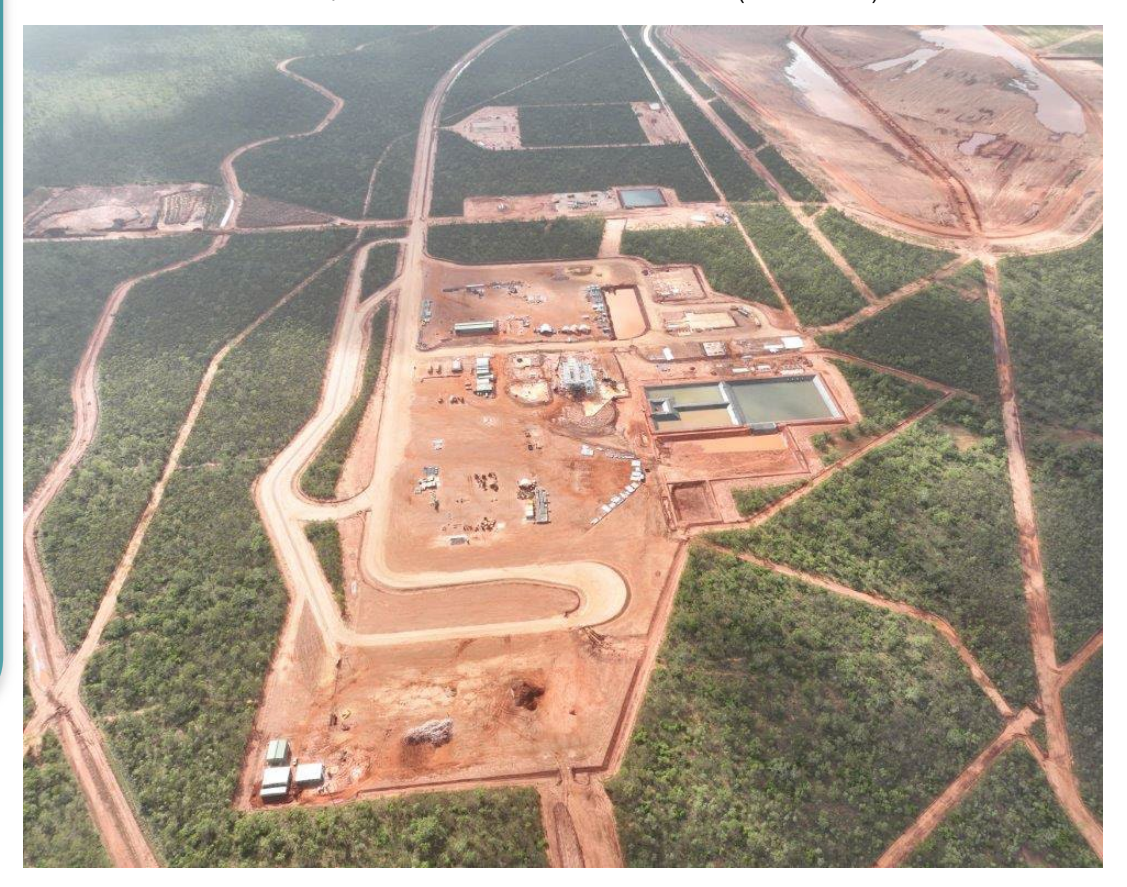
Figure 1: Thunderbird Process Plant site (mid-January 2023)

Cash balance of $5.2m as at 31 December 2022 (unaudited)