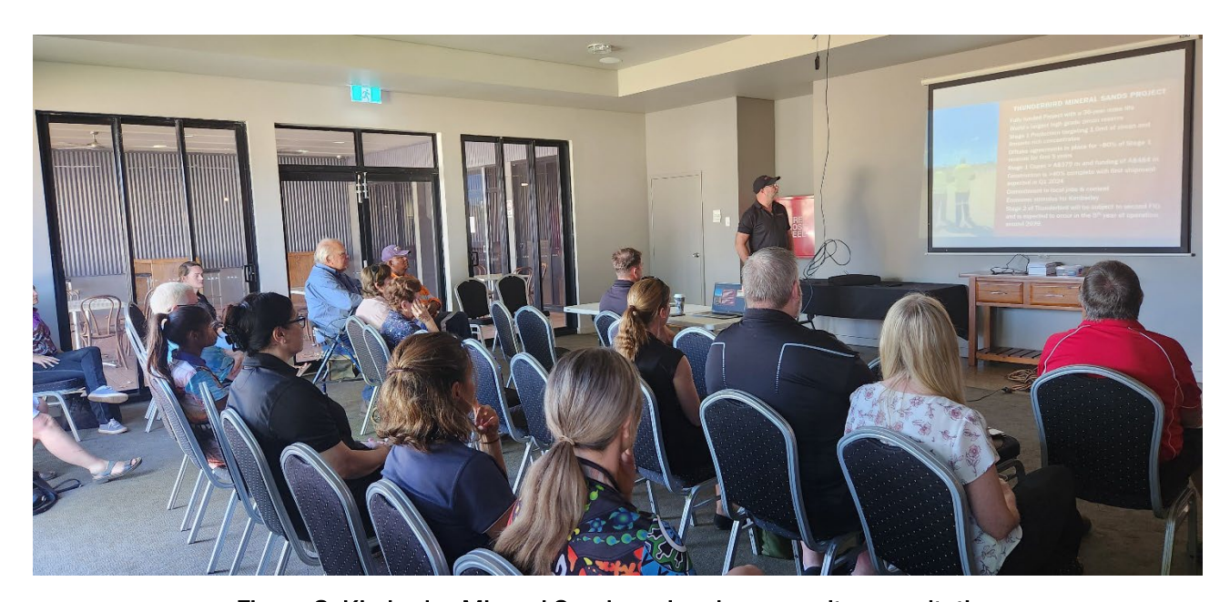
Figure 8: Kimberley Mineral Sands regional community consultation

The KMS team continued community engagement and consultation processes throughout the quarter. These included several community based and Traditional Owner forums across Broome and Derby, providing information on the recent FID announcement and site activities.