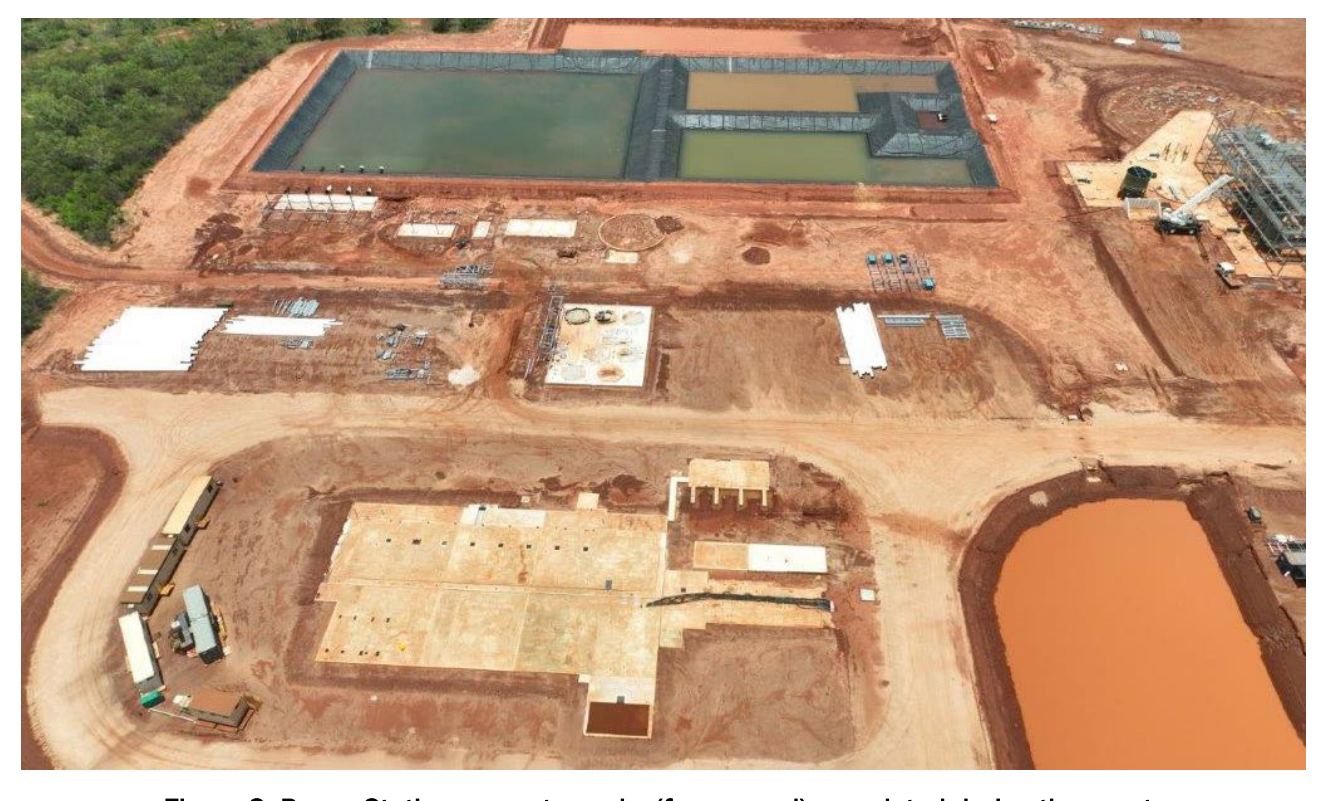
Figure 3: Power Station concrete works (foreground) completed during the quarter