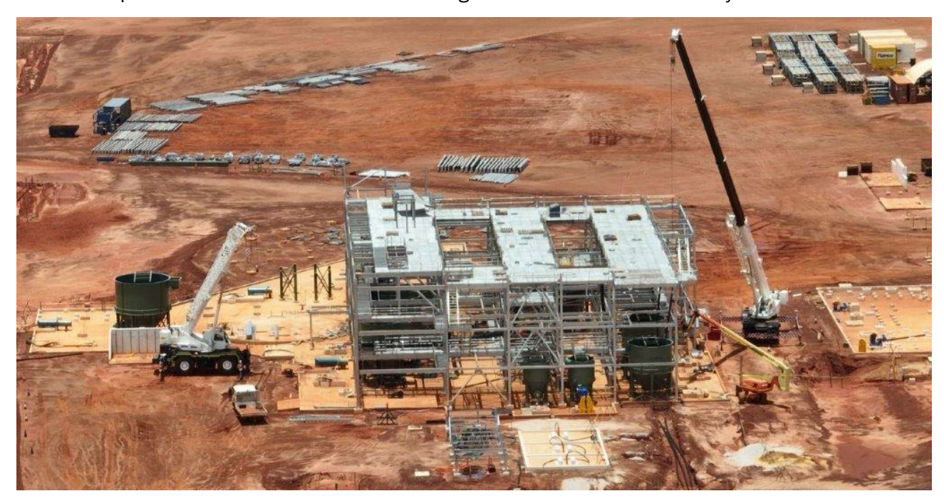
Figure 2: Wet Concentrator Plant steel installation

Activities for the quarter included a Final Investment Decision (FID) in early October 2022 for the flagship Thunderbird Mineral Sands Project (Thunderbird) in the Kimberley region of Western Australia. Site construction activities progressed very well throughout the quarter and were 66% complete as at the end of December 2022. Recent seasonal weather events within the Kimberley region of Western Australia have not impacted construction activities with images below taken in mid-January 2023.