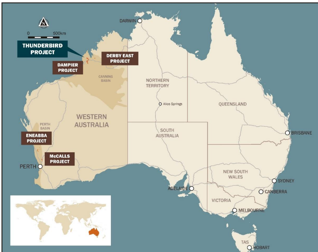
Figure 2: Location of Sheffield's Mineral Sands Projects